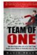
Team of One: Get the Sales Results...