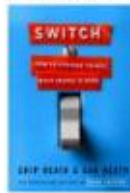
Switch: How to Change Things When C...

Most Popular Books in Business & Investing