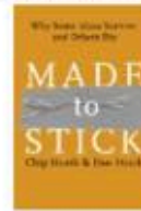
Made to Stick: Why Some Ideas Survi...